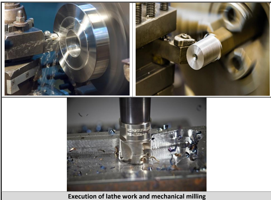
Execution of lathe work and mechanical milling