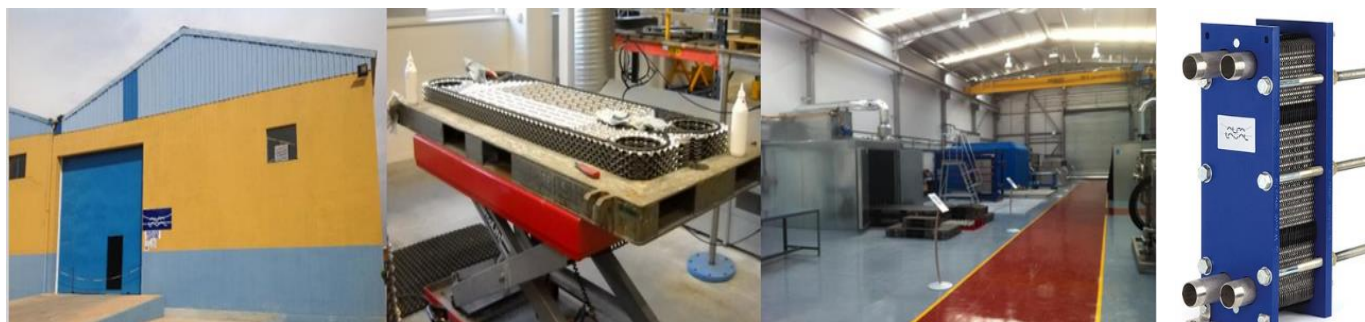
Supply of Plate Type Heat Exchangers (PHE) and spare parts.